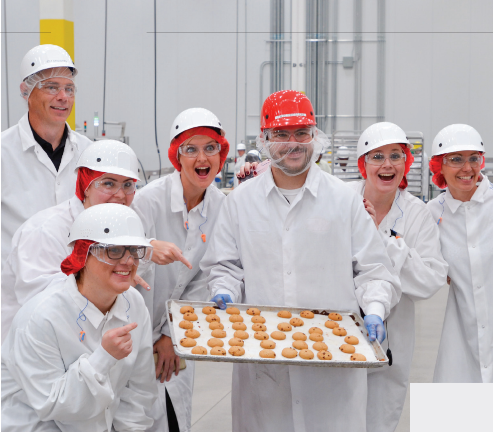
A TASTE FOR CHANGE

Enjoy Life Foods boasts North America’s largest allergy-friendly bakery. The 200,000 s.f. facility is located in Jeffersonville, Indiana.