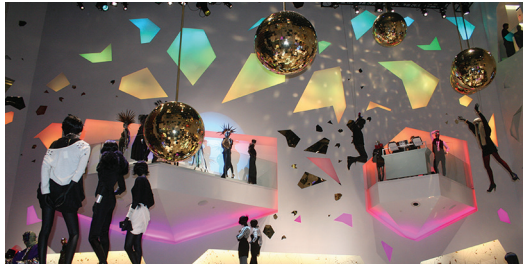
H&M retail facility Las Vegas, Nev. Retail