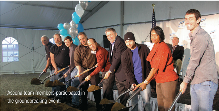
Ascena team members participated in the groundbreaking event.

Gray was selected to provide design-build services for an expansion of Ascena Retail Group 's existing 460,000 s.f. distribution center in Central Ohio, bringing the total square footage to 760,000. The new facility will house distribution operations for over 3,800 stores, including leading brands such as Lane Bryant and Justice. The expansion is expected to add 200 jobs to the center's existing 300-person workforce.