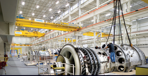
Siemens Gas Turbine manufacturing facility Charlotte, N.C. Manufacturing