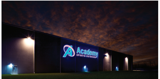
Academy Sports + Outdoors distribution center Jeffersonville, Ga. Distribution