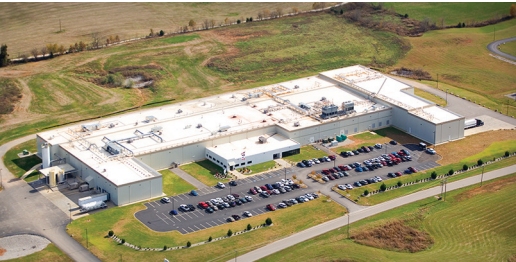
T. Marzetti Sister Schubert's Bakery facility Horse Cave, Ky. Food & Beverage