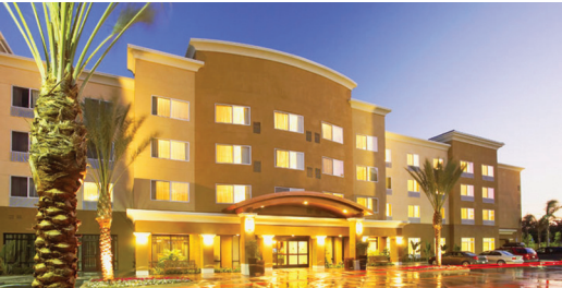
Courtyard by Marriott Anaheim, Calif. Hospitality